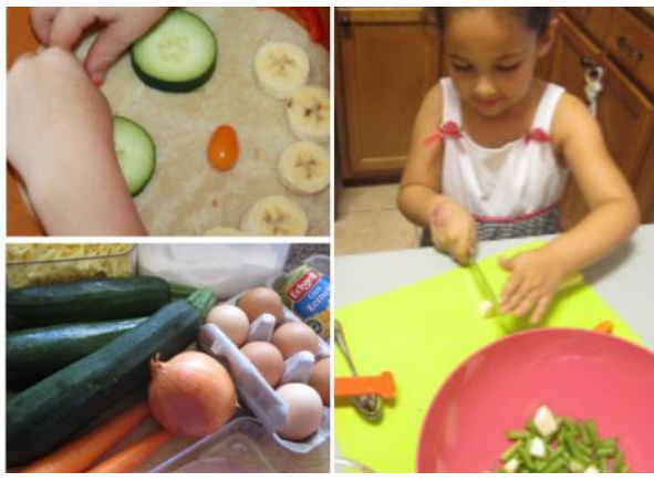
Learning lessons for healthy eating habits are invaluable and strengthen the foundation for a healthy lifestyle.