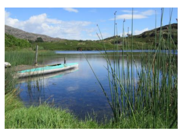
To learn more about MSUE water programs visit <a href="https://www.canr.msu.edu/resources/msu-extension-water-programs-lakes-streams-and-watersheds">https://www.canr.msu.edu/resources/msu-extension-water-programs-lakes-streams-and-watersheds</a>