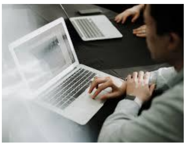
The Adulting 101 program accommodated the need to offer this series via zoom. MSUE was able to reach young people in Barry County as well as in other states.