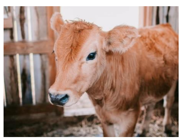
4-H is Michigan's largest youth development program serving over 200,000 youth each year.